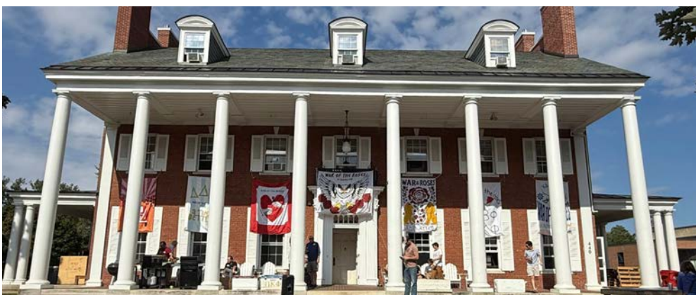
Owl House Adorned with War of the Roses Banners.