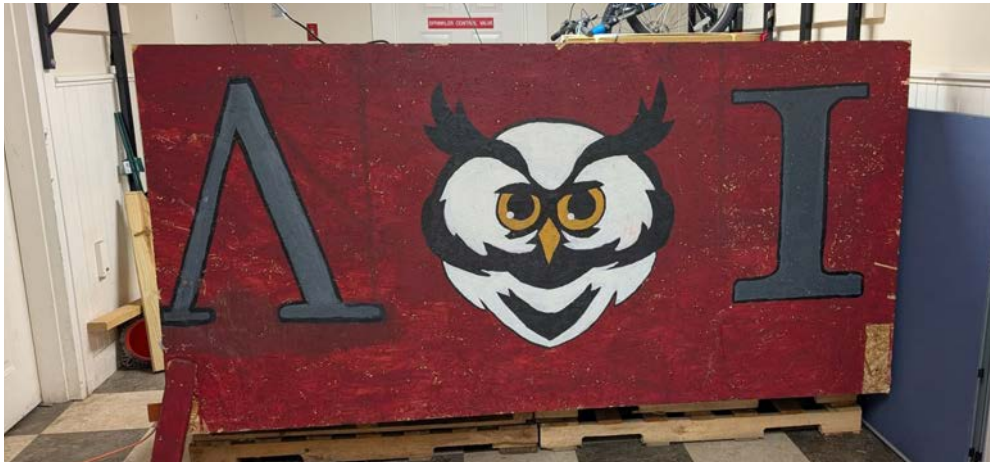
These Pi Kapp guys sure are into owls.