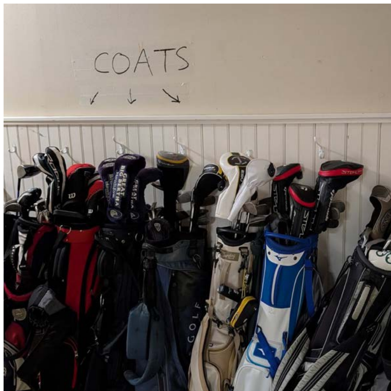
Those are some funny looking coats.