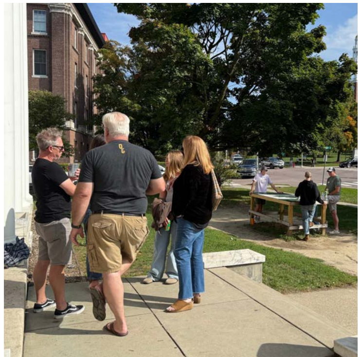
Actives, parents, and actives hanging out.