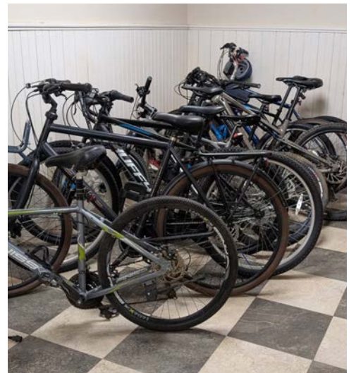
Definetly an active group!