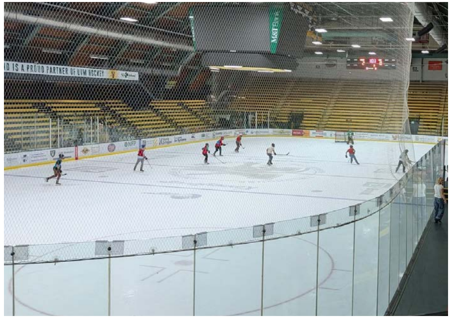
A packed house at the charity hockey game!