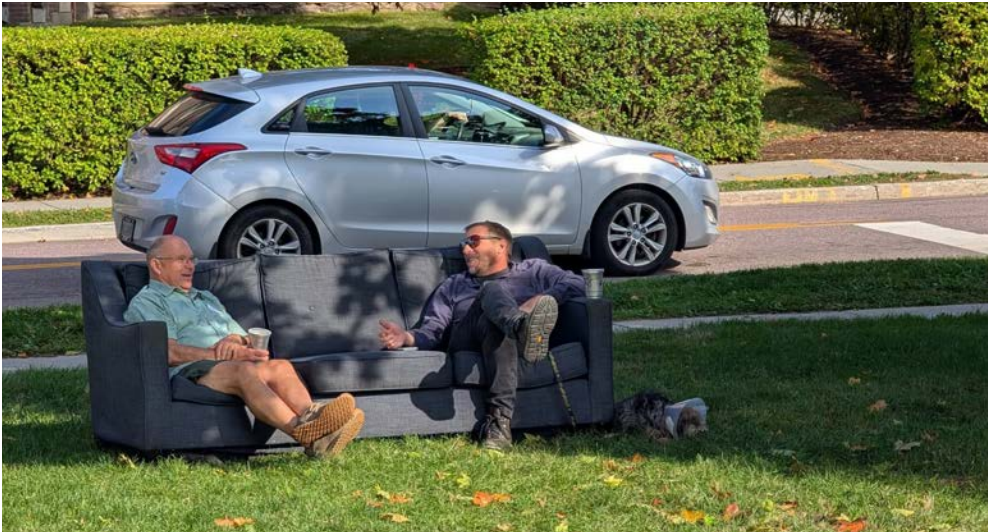
Dads chilling on a frat lawn couch.