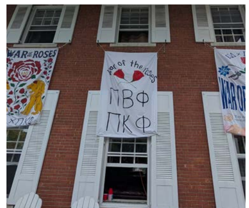
War of the Roses Banners.